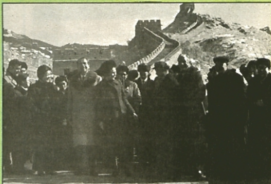
President Nixon tours the Great Wall of China.